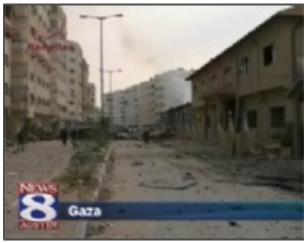
A tenuous peace after weeks of war in Gaza between Hamas and Israel.